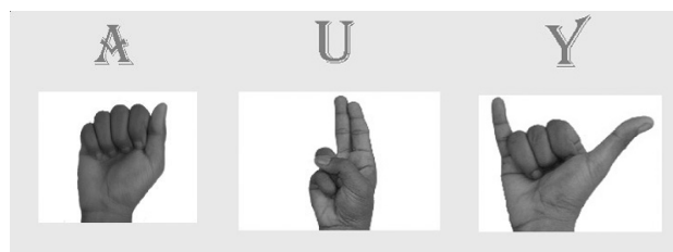
Fig. 2 Some samples of recognized signs of ASL

In the present study, the highest recognition rate is obtained for 'H','L','R','U'and'V', and the lowest recognition rate is found for 'K' and 'X'. Fig. 2 illustrates 3 recognized ASL alphabets 'A', 'U' and 'Y'.